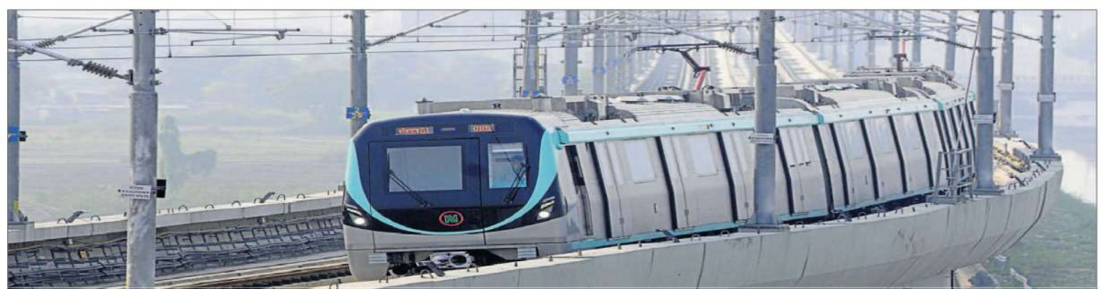
The new route will help make commuting easier for many residents living in high-rises in Greater Noida West.