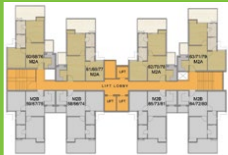
CLUSTER PLAN BLOCK- G, H, I

TYPE - M2 A [ BLOCK- G, H, I ] 2 BEDROOM + DRAWING ROOM/DINING + KITCHEN + 2 TOILET + 2 BALCONY CARPET AREA = 48.50 SQ. MT. (522.00 SQ. FT) BALCONY AREA = 14.68 SQ. MT. (158.00 SQ. FT) COMMON AREA = 20.38 SQ. M. (219.00 SQ. FT) EXTERNAL WALLS & RCC COLUMNS AREA = 5.17 SQ. MT. (56.00 SQ. FT) TOTAL AREA = 88.73 SQ. MT. (955.00 SQ. FT)