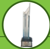
CNBC AWAAZ REAL ESTATE AWARDS 2017-18 BEST RESIDENTIAL PROJECT AFFORDABLE SEGMENT - NATIONAL - GAUR CASCADES