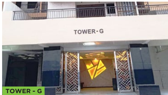
TOWER - G