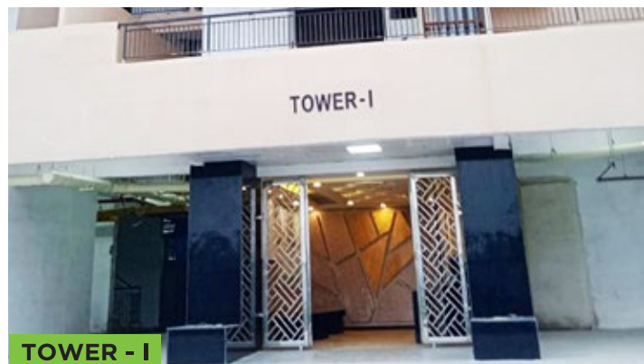
TOWER - I