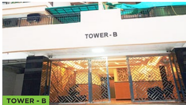
TOWER - B