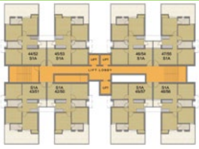
CLUSTER PLAN BLOCK- E & F

Disclaimer: Total Area :- The carpet area of the said apartment and the entire area enclosed by its periphery walls including area under walls, columns, balconies and lofts etc. and half the area of common walls with other premises/ apartments which form integral part of said apartment and common areas shall mean all such parts/areas in the entire said project which the Allottee(s) shall use by sharing with other occupants of the said project including entrance lobby, electrical shafts, fire shafts, plumbing shafts and services ledges on all floors, common corridors, and passages, staircases, staircase shaft, mummies, services area including but not limited to the machine rooms, security/fire control rooms, maintenance offices/stores etc, if provided. Carpet Area (as per RERA guidelines):- The net usable floor area of an apartment, excluding the area covered by the external walls, areas under services shafts, exclusive balcony or verandah area and exclusive open terrace area, but includes the area covered by the internal partition walls, column & structural walls of the apartment. 1 Sqm= 1 0,764 sq. ft., 304,8 mm= 1'-0". • The colour and design of the tiles can be changed without any prior notice. • Variation in the colour and size of vitrified tiles/granite may occur. • Variation in colour in mica may occur. • Area in all categories of apartments may vary up to ±3% without any change in cost. • However, in case the variation is beyond ±3% charges are applicable.