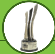
NDTV PROPERTY AWARDS 2016-17 BEST TOWNSHIP PROJECT - GAUR CITY