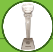
TIMES BUSINESS AWARDS 2019 BEST REAL ESTATE DEVELOPER OF THE YEAR - GAURSONS INDIA