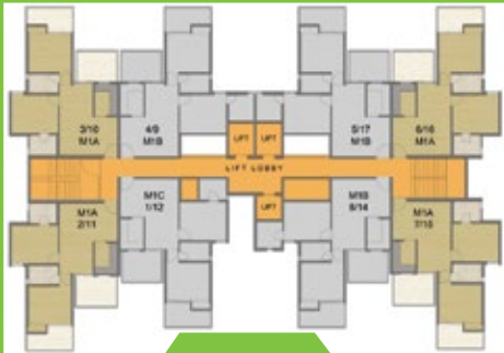
CLUSTER PLAN BLOCK- A & B

2 BEDROOM + DRAWING ROOM/DINING + KITCHEN + 2 TOILET + 2 BALCONY CARPET AREA = 57.14 SQ. MT. (615.00 SQ. FT.) BALCONY AREA = 14.59 SQ. MT. (157.00 SQ. FT.) COMMON AREA = 20.55 SQ. MT. (221.00 SQ. FT.) EXTERNAL WALLS & RCC COLUMNS AREA = 5.72 SQ. MT. (62.00 SQ. FT.) TOTAL AREA = 98.00 SQ. MT. (1055.00 SQ. FT.)