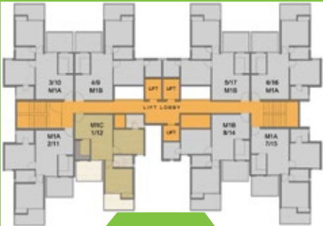
CLUSTER PLAN BLOCK- A & B

2 BEDROOM + DRAWING ROOM/DINING + KITCHEN + 2 TOILET + 2 BALCONY CARPET AREA = 57.14 SQ. MT. (615.00 SQ. FT.) BALCONY AREA = 14.59 SQ. MT. (157.00 SQ. FT.) COMMON AREA = 20.55 SQ. MT. (221.00 SQ. FT.) EXTERNAL WALLS & RCC COLUMNS AREA = 5.72 SQ. MT. (62.00 SQ. FT.) TOTAL AREA = 98.00 SQ. MT. (1055.00 SQ. FT.)