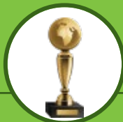
SMART CITY EMPOWERING INDIA AWARDS 2020 BEST SMART CITY DEVELOPER OF THE YEAR - GAURSONS INDIA

The pointed, unnerving focus on creating a better tomorrow has been the driving force at Gaur's. It is our foresight, eye for perfect locations and excellence in execution that has earned us a much-deserved success throughout our long journey. And armed with the confidence and verve to enrich lives, one can safely say that the future belongs to Gaur's.