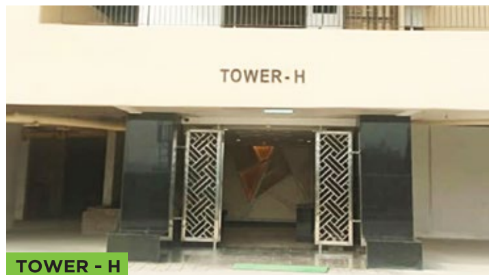
TOWER - H