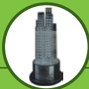
PMAY EMPOWERING INDIA AWARDS 2019 THE MOST WELL PLANNED UPCOMING PROJECT IN EWS CATEGORY - GAURS SIDDHARTHAM