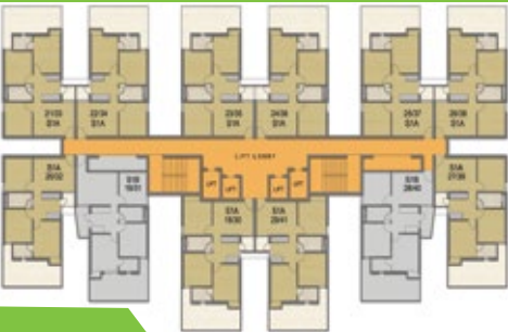
CLUSTER PLAN BLOCK- C & D

ENTRY + 3 BEDROOM + DRAWING ROOM/DINING + KITCHEN + 2 TOILET + 2 BALCONY CARPET AREA = 59.83 SQ. MT. (644.00 SQ. FT.) BALCONY AREA = 19.24 SQ. MT. (207.00 SQ. FT.) COMMON AREA = 23.10 SQ. MT. (249.00 SQ. FT.) EXTERNAL WALLS & RCC COLUMNS AREA = 7.93 SQ. MT. (85.00 SQ. FT.) TOTAL AREA = 110.10 SQ. MT. (1185.00 SQ. FT.)