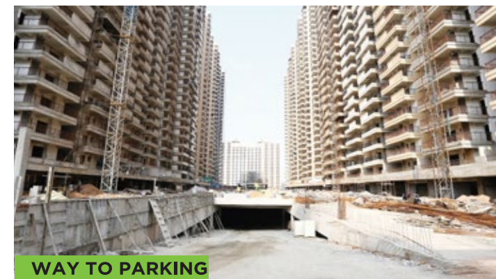
WAY TO PARKING