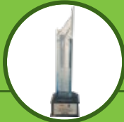
CNBC AWAAZ REAL ESTATE AWARDS 2017-18 BEST RESIDENTIAL PROJECT AFFORDABLE SEGMENT - NORTH INDIA - GAUR CASCADES