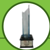
CNBC AWAAZ REAL ESTATE AWARDS 2018-19 BEST RESIDENTIAL PROJECT AFFORDABLE SEGMENT - NORTH ZONE - GAUR CITY-2