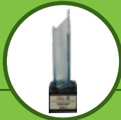
CNBC AWAAZ REAL ESTATE AWARDS 2016-17 BEST TOWNSHIP PROJECT - GAUR CITY