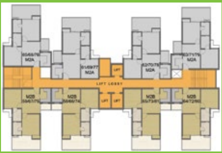
CLUSTER PLAN BLOCK- G, H, I

Disclaimer: Total Area :- The carpet area of the said apartment and the entire area enclosed by its periphery walls including area under walls, columns, balconies and lofts etc. and half the area of common walls with other premises/ apartments which form integral part of said apartment and common areas shall mean all such parts/areas in the entire said project which the Allottee(s) shall use by sharing with other occupants of the said project including entrance lobby, electrical shafts, fire shafts, plumbing shafts and services ledges on all floors, common corridors, and passages, staircases, staircase shaft, mummies, services area including but not limited to the machine rooms, security/fire control rooms, maintenance offices/stores etc, if provided. Carpet Area (as per RERA guidelines):- The net usable floor area of an apartment, excluding the area covered by the external walls, areas under services shafts, exclusive balcony or verandah area and exclusive open terrace area, but includes the area covered by the internal partition walls, column & structural walls of the apartment. 1 Sqm= 1 0,764 sq. ft., 304,8 mm= 1'-0". • The colour and design of the tiles can be changed without any prior notice. • Variation in the colour and size of vitrified tiles/granite may occur. • Variation in colour in mica may occur. • Area in all categories of apartments may vary up to ±3% without any change in cost. • However, in case the variation is beyond ±3% charges are applicable.