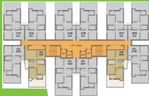
CLUSTER PLAN BLOCK - C & D