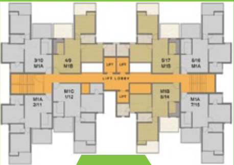
CLUSTER PLAN BLOCK- A & B

2 BEDROOM + DRAWING ROOM/DINING + KITCHEN + 2 TOILET + 2 BALCONY CARPET AREA = 57.14 SQ. MT. (615.00 SQ. FT.) BALCONY AREA = 14.59 SQ. MT. (157.00 SQ. FT.) COMMON AREA = 20.55 SQ. MT. (221.00 SQ. FT.) EXTERNAL WALLS & RCC COLUMNS AREA = 5.72 SQ. MT. (62.00 SQ. FT.) TOTAL AREA = 98.00 SQ. MT. (1055.00 SQ. FT.)