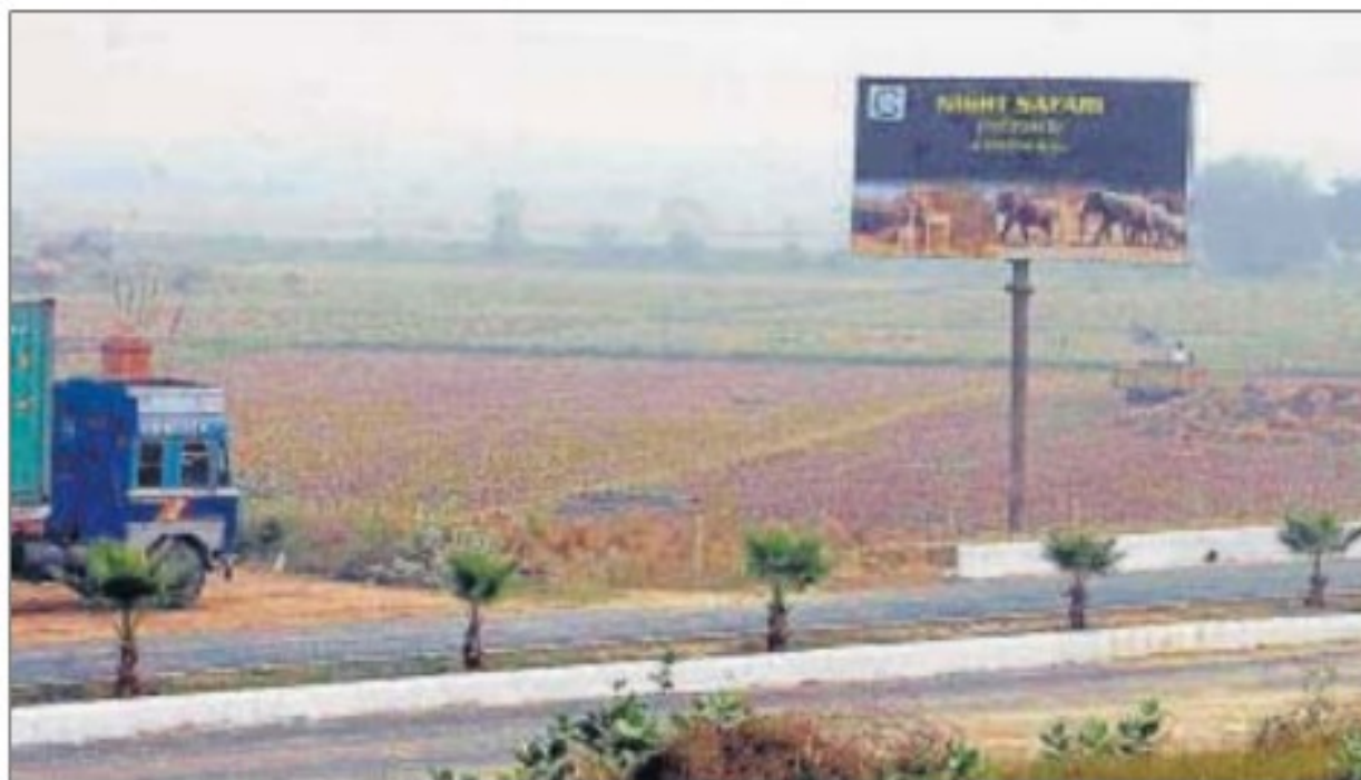
The area earmarked for night safari is around 200 acres, near the Gautam Buddha University. Once ready, this will be India's first and the world's fourth such safari.