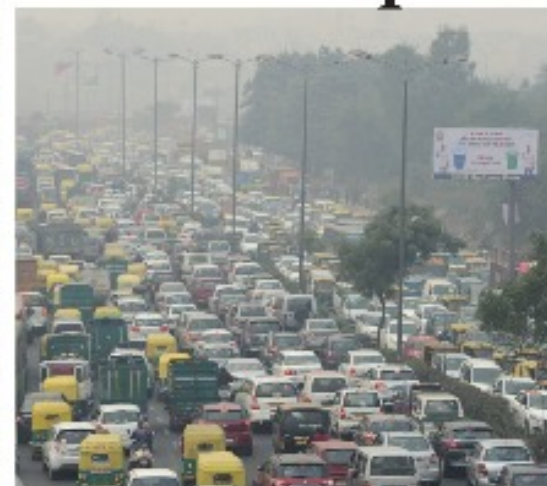
Traffic on major stretches was hot-a-blue due to New Year revelry, coupled with low visibility due to smog.