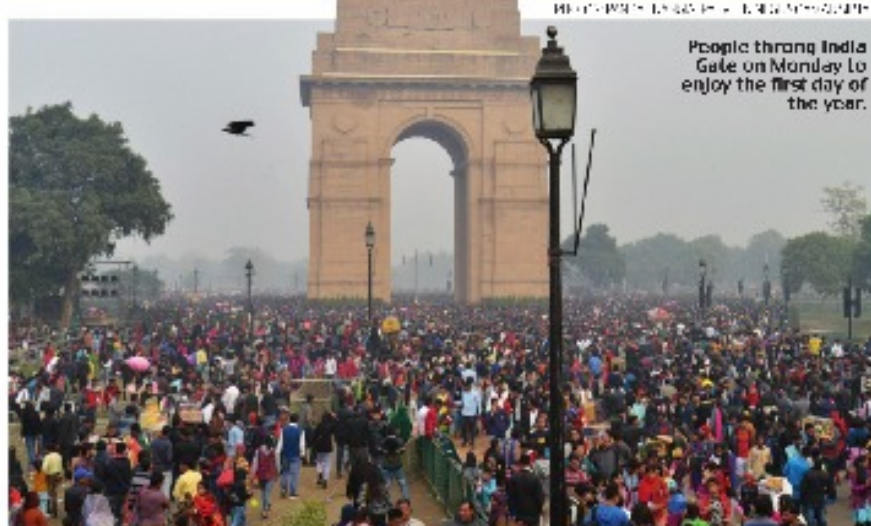
People throng India Gate on Monday to enjoy the first day of the year.