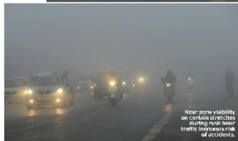
Near zero visibility on certain stretches during rush hour traffic increases risk of accidents.

Local factors for pollution in Delhi include vehicular exhaust, road dust, power plant emission and solid waste burning in landfills.