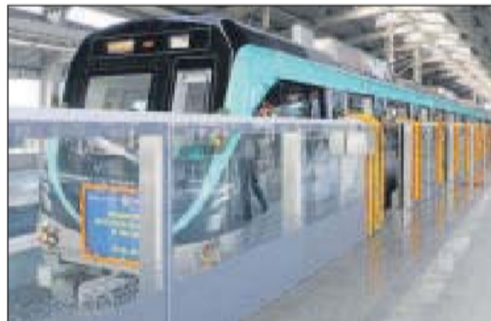
■ The Phase 1 of Aqua Line— from Sector 51 in Noida to Depot station in Greater Noida — was inaugurated Friday.

The chief minister inaugurated six development projects of Noida and laid the foundation of three other projects. He remotely launched a bridge built across the Yamuna, parallel to the Kalindi Kunj barrage, Shilp Haat in Sector 33, a new flyover over Shahdara drain, a command and control centre in Sector 94, an old age home and orphanage in Sector 62 and Traffic Park in Sector 108. Foundation stone were also laid for a 5.5km elevated road above Shahdara drain, 2.5km elevated road above Dadri Road and an underpass at Sector 51/52 and Sector 71/72 traffic intersection.