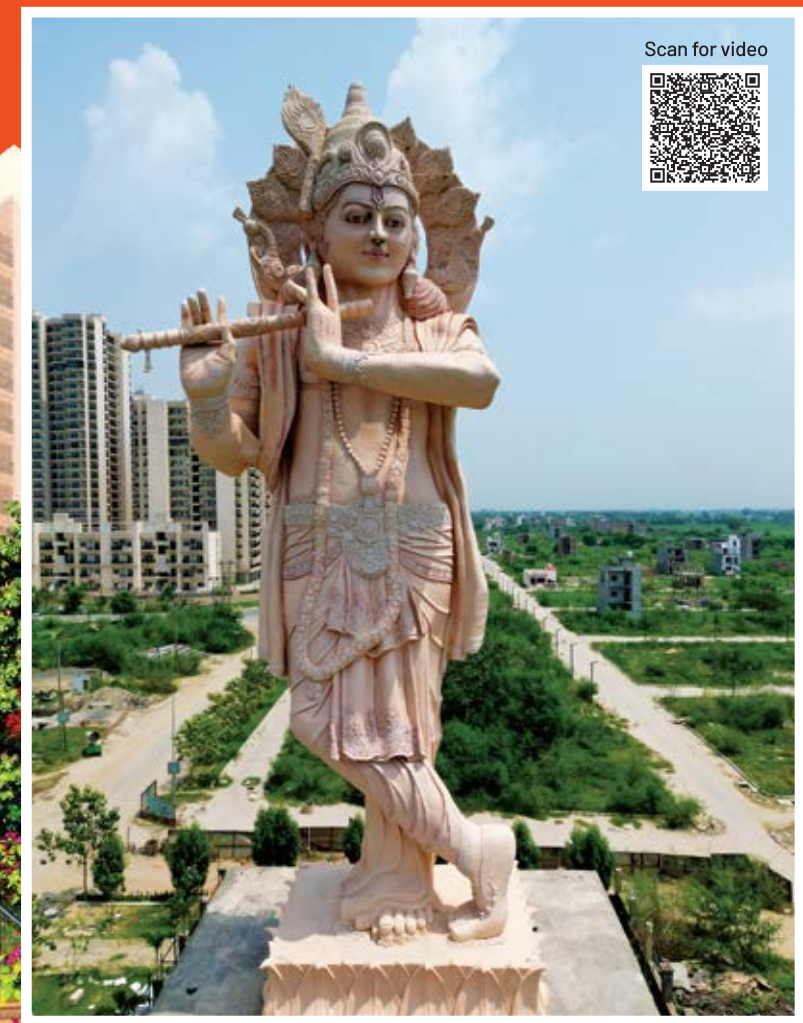
Scan for video