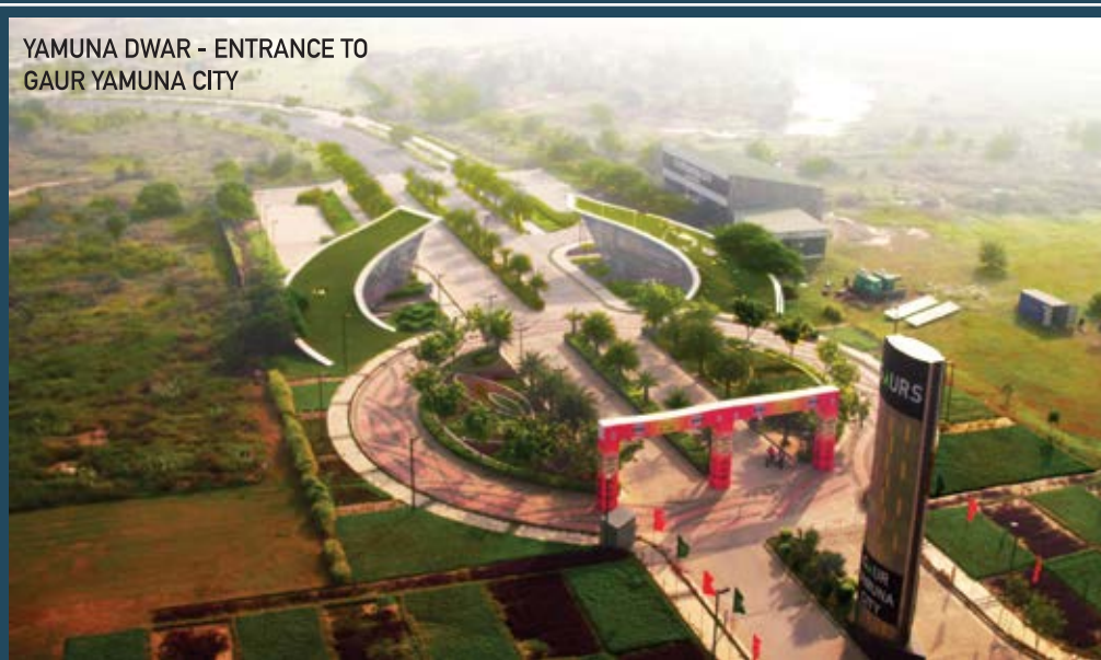
YAMUNA DWAR - ENTRANCE TO GAUR YAMUNA CITY