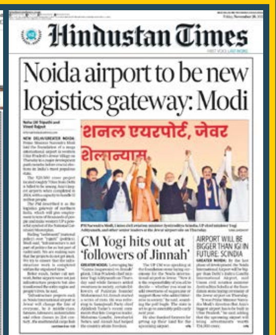
Hindustan Times 8th October 2020