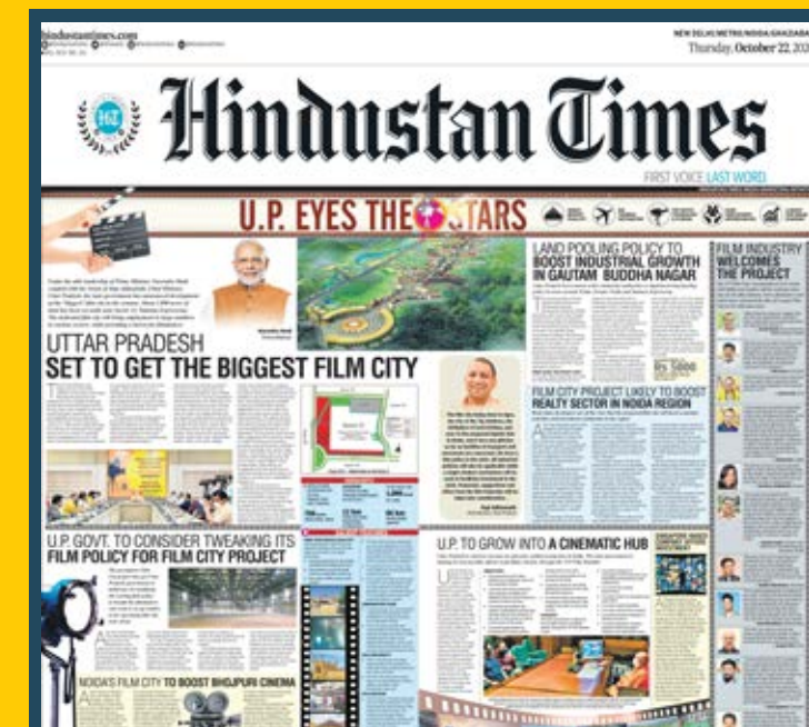
Hindustan Times 22nd October 2020