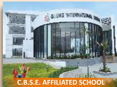
C.B.S.E. AFFILIATED SCHOOL