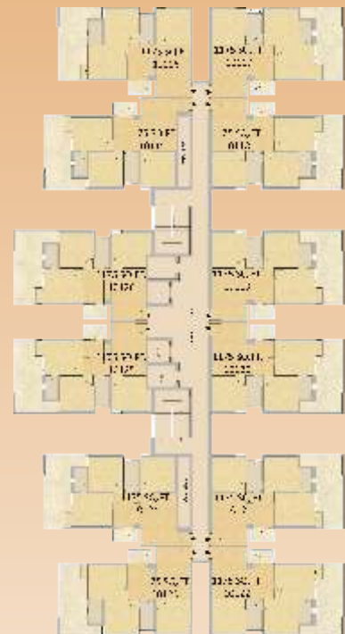
Tower - O