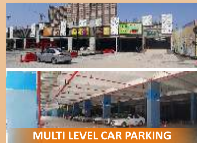
MULTI LEVEL CAR PARKING