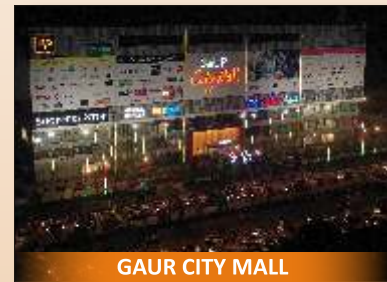
GAUR CITY MALL