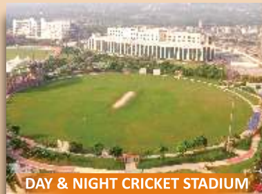
DAY & NIGHT CRICKET STADIUM