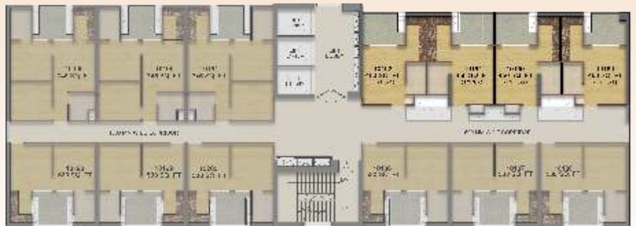
Tower - V

1 BEDROOM + KITCHEN + 1 TOILET + BALCONY